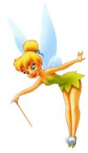
Infant II Tinker Bell

We are both very excited to begin this new adventure. This will be an unforgettable year for all of us.