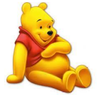
Infant II Winnie the Pooh

We focused on letters P and R, and it was amazing to see how well they are recognizing their corresponding vocabulary. Numbers 9-10 were the highlight of our counting routine. We have taken a giant leap and started counting by 10s; they are really excited about it.